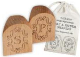
CLASSIC SALT & PEPPER SHAKERS