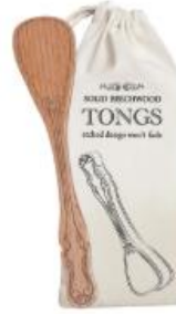
CLASSIC BEECHWOOD TONGS