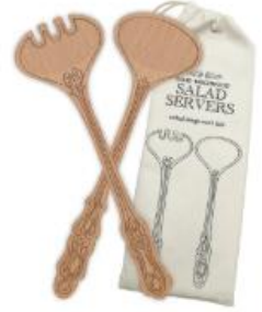
CLASSIC SALAD SET