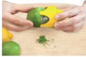
CITRUS ZESTER & REAMER