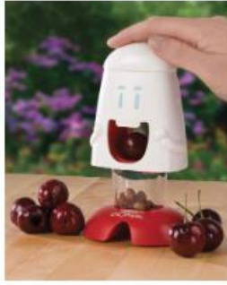
CHERRY CHOMPER® CHERRY PITTER