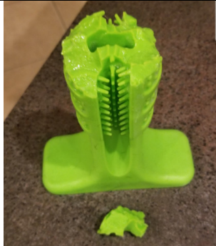
Bristly Knock Off Chewed by Dog